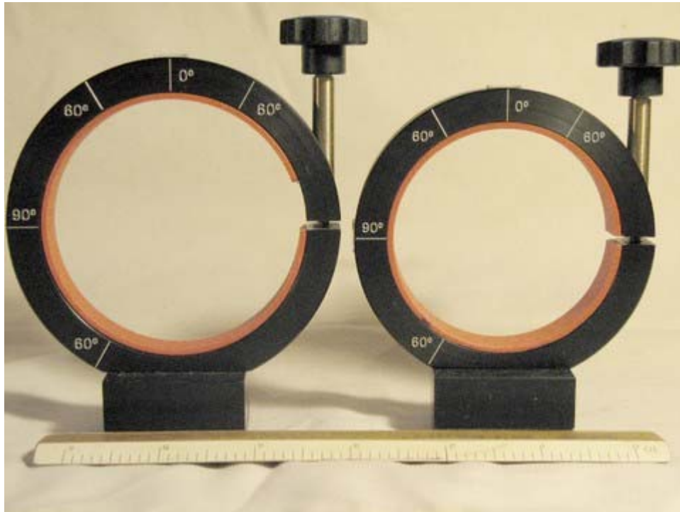
RingT Back face show degree rotation marks. Notice the 0° mark.

specifications: Agno's RingT dimensions.