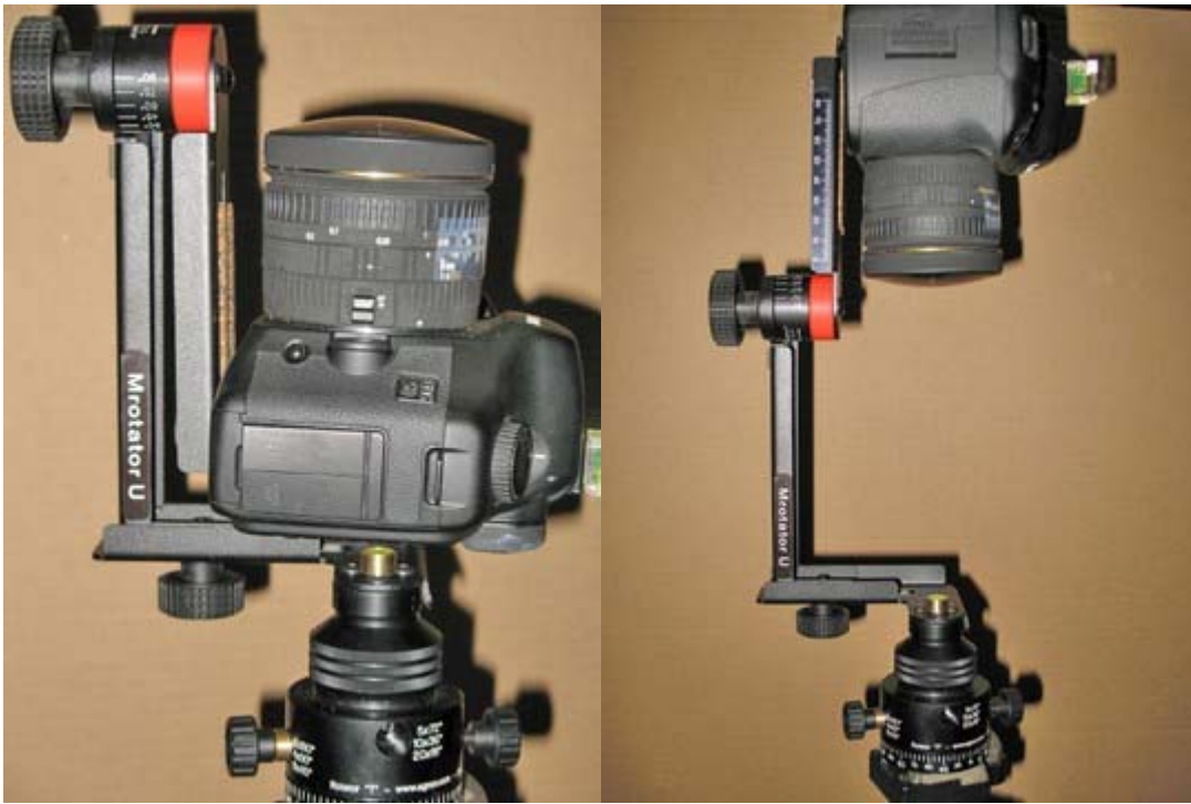
Zenith up and Nadir down images