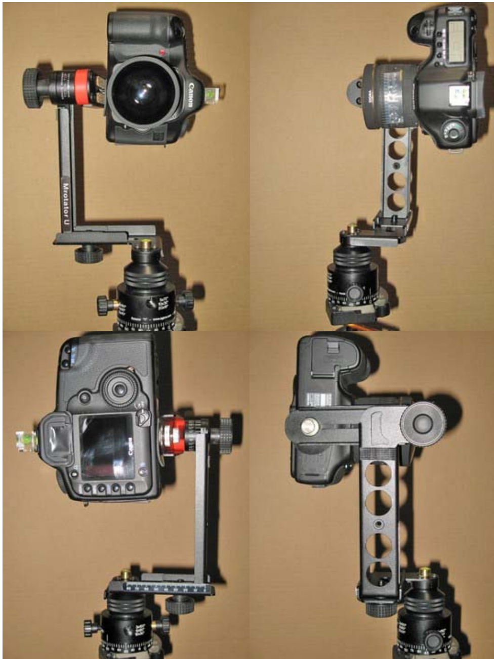
Lower right photo I used small piece of Velcro for wired shutter release docking.