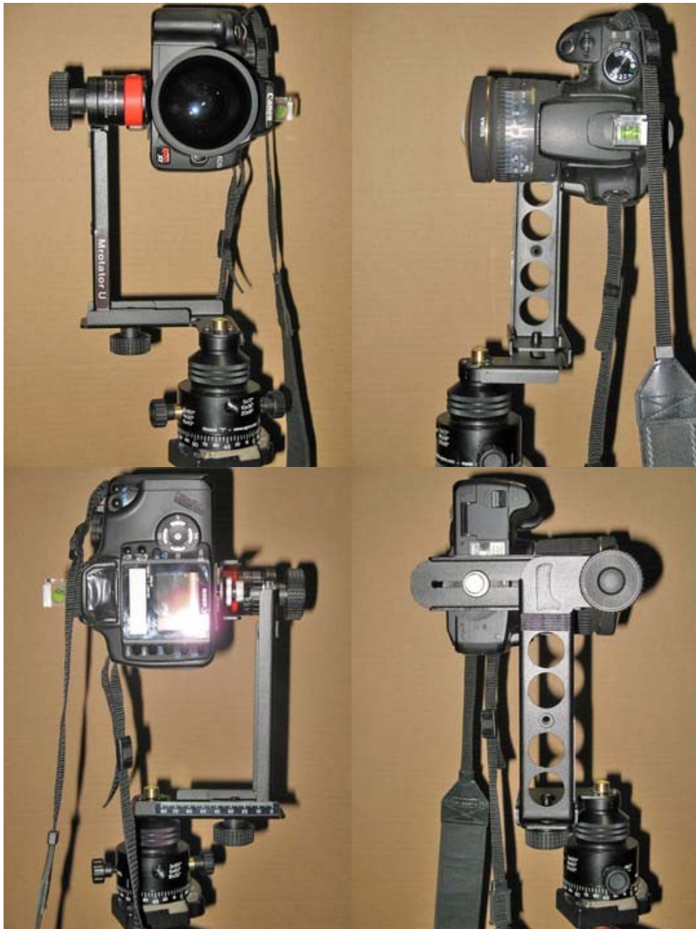
Lower right photo I used a small piece of Velcro for shutter release docking