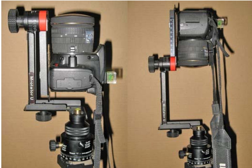
Zenith up and Nadir down images